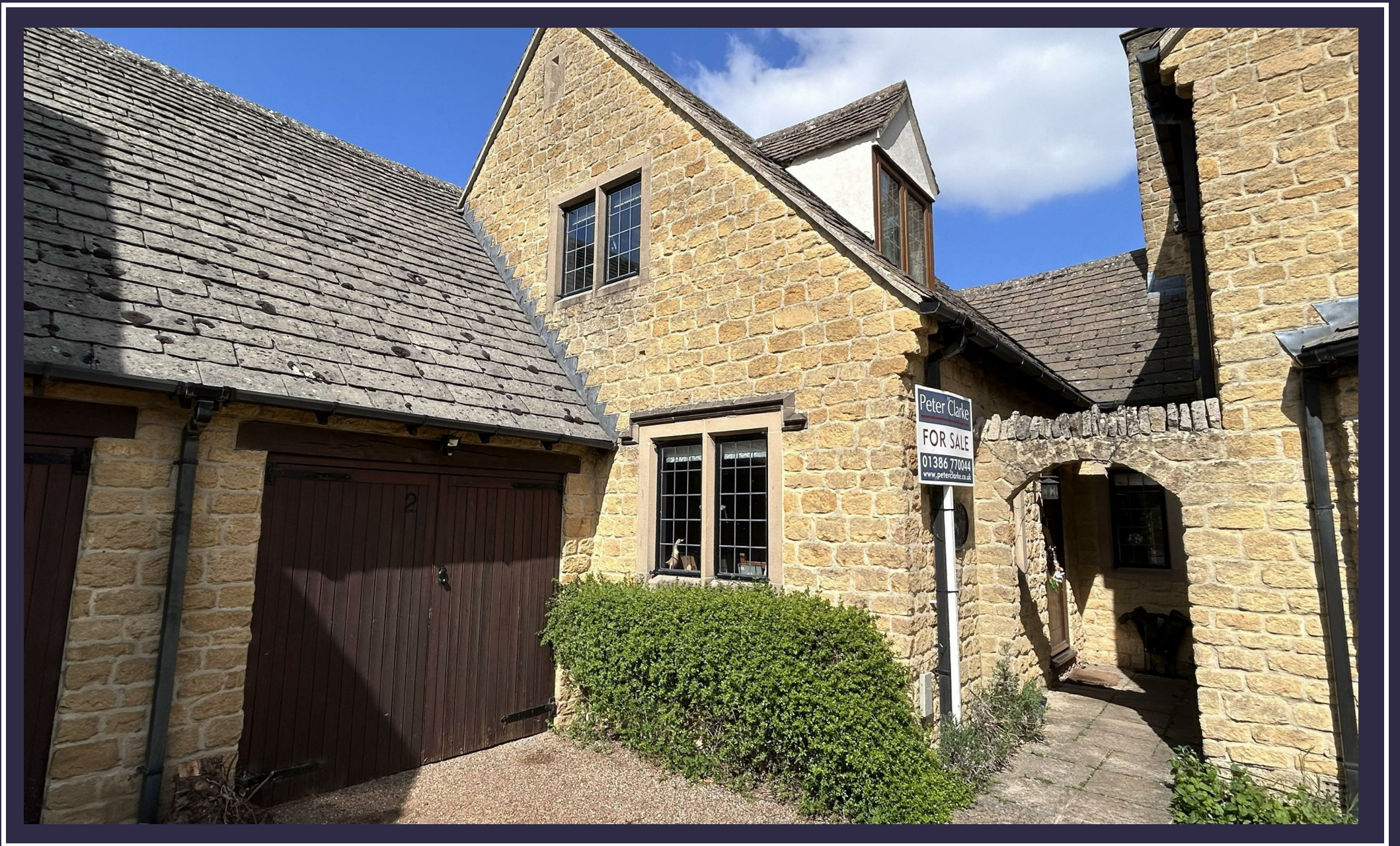
2 Inverlea Court, Mickleton, GL55 6TZ